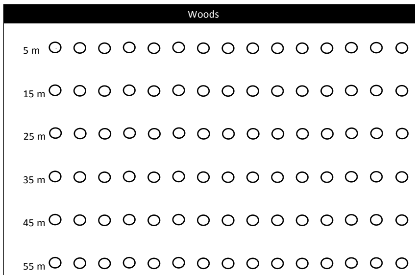
Figure 2. A diagram of the arrangement of the plots used to measure deer-browsing on soybeans in Little Creek, Delaware, 2055–2006.