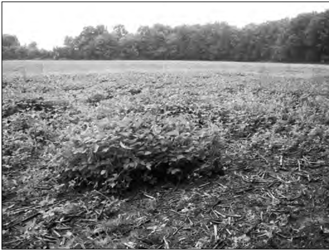
Figure 1. Soybean field in study site.

Double crop soybeans were planted after the wheat harvest on July 15, 2005, and July 11, 2006, and harvested in the fall on December 7, 2005, and November 10, 2006, respectively. Deer density on the study area was 21 deer/km 2 (Bowman 2006). Sweetgum ( Liquidambar styraciflua ), sycamore ( Platanus occidentalis ), red maple ( Acer rubrum ), white oak ( Quercus alba ), pin oak ( Quercus palustris ) and American holly ( Ilex opaca ) dominated the forested portions of the study site (Rogerson 2005). The average maximum and minimum temperature during the growing season (May through October) were 26.6° C and 15.6° C, respectively, and precipitation averaged 10.5 cm (National Climatic Data Center 2004).