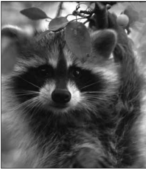
Figure 1. Raccoon in crabapple tree.

and cats, as well as wildlife (McQuiston et al. 2001, Blanton et al. 2011). Rabid raccoons also present a significant threat to humans because this species is well-adapted to life in urban and suburban areas (Uhaa et al. 1992)