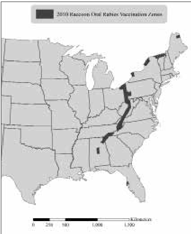
Figure 2. Raccoon oral rabies vaccination areas within the United States (2010).

2007). If raccoon rabies were to spread beyond its current range, the costs for PEP in newly affected areas would likely increase, as it has in the current area. To date, Kemere et al. (2002) completed the only comprehensive assessment of the benefits of a large scale raccoon ORV program and estimated the net present value of benefits to be $138 million to $628 million. However, estimates of benefits are highly dependent on the assumed rate and pattern of spread in the absence of an ORV-created zone. Kemere et al. (2002) applied 2 rates of spread: 40 km/year and 120 km/year that began from and mimicked the current westward edge of raccoon rabies. However, difference in the spread and rate of raccoon rabies in relation to environmental factors has been shown, and no attempt was made to tailor the rate of spread to differences in geography, climate, or land use (Childs et al. 2001).