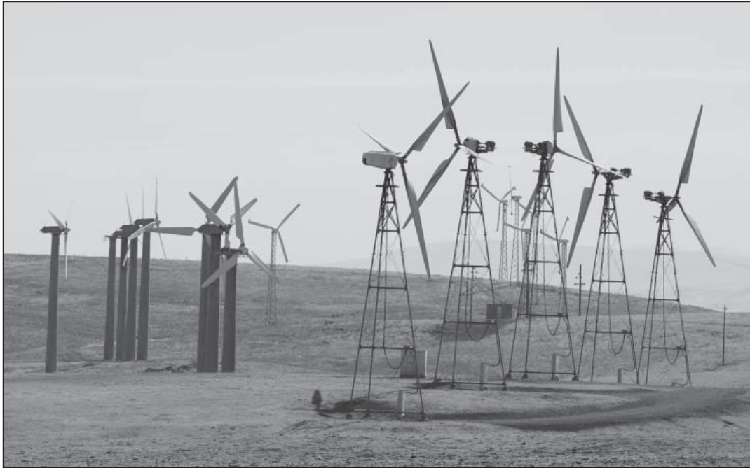
Figure 1. Examples of lattice turbines, right, and monopole turbines, left.