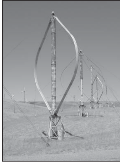
Figure 2. Example of vertical-axis design turbine, the only type of its kind put into industrial-scale operation. A few others appeared singly or as demonstration projects. The ones pictured were 150 kW. This type also occurred as a 250 kW version. Both types were in the Altamont Pass until 2000, and both were removed in 2002.

All wildlife fatality estimates reviewed