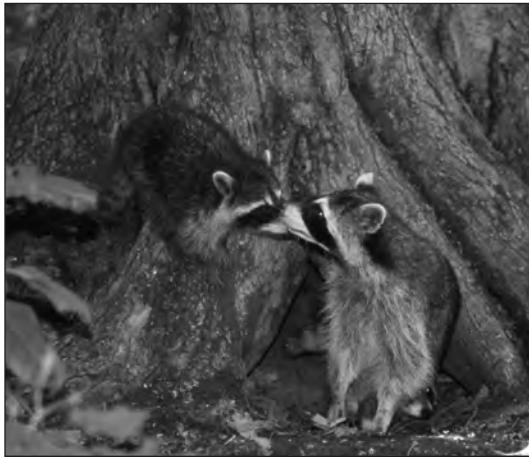
Female raccoon with young.

includes parameters for initial capture ( p ) and recapture ( c ) probabilities, but differs from other estimators in that N is a derived parameter from the number of unique animals captured and p (Finley et al. 2005). The exclusion of population estimates from the likelihood function allows initial efforts to be centered on obtaining parsimonious estimates of p and c for the combined data set, which then can be used to generate more accurate estimates of N for subsets of the data (e.g., forest patches; White 2005).