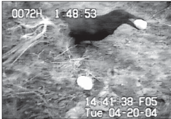
A raven is pictured in the act of taking an egg bait (left), then eating it (below).