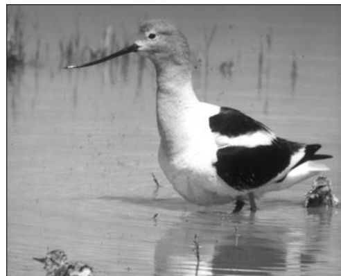
Figure 3 . American avocet ( Recurvirostra americana ) and young.

Food habit studies of eared grebes on the GSL have been conducted during migration and staging and have reported that adult brine shrimp were an important part of eared grebe diets (Table 1). During the early fall, eared grebes consumed both brine shrimp and brine fly adults (Paul 1996, Conover and Vest 2009); by late November, they ate brine