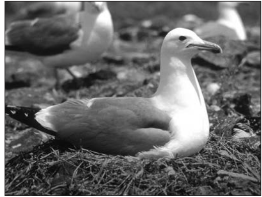
Figure 4. California gull ( Larus californicus ).

Wilson's phalaropes and red-necked phalaropes both use the GSL extensively during fall migration, particularly from July through October. Phalarope species are the only shorebirds that regularly occur in pelagic areas of the GSL, and the GSL hosts >50% of North America's Wilson's phalaropes each fall. Throughout their range, Wilson's phalaropes forage on brine shrimp, as well as brine fly larvae, pupae, and adults (Table 1). Three birds collected from shallow water mud flats of the GSL in 1984 had consumed solely adult brine flies (Mahoney and Jehl 1985a). Colwell and Jehl (1994) found age difference in foraging exists among Wilson's phalaropes, with adults consuming a mix of brine shrimp, brine fly adults, and other aquatic invertebrates, while