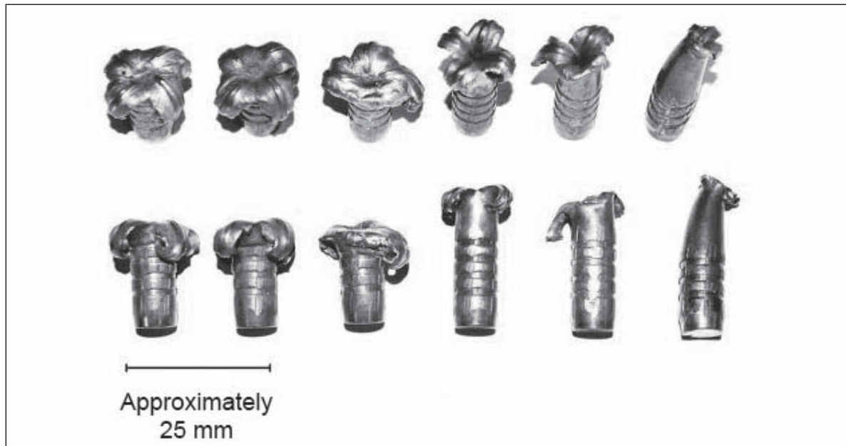
Figure 3. A sample of 6 non-lead bullets recovered from elk carcasses at Theodore Roosevelt National Park, viewed from the side (at bottom) and above (at top), demonstrating commonly observed controlled expansion (2 bullets at left) versus less frequent intermediate expansion (center right), occasional fragmentation (center left and second from right), and rare instances of non-expansion and bullet tumbling (at right).

impact has been previously identified as a measure of shot efficacy, and time associated with animal movements is directly related to levels of incapacitation (Ruth and Simmons 1999, Maiden 2009, Caudell 2013). The top speed of elk has been reported as 72 km per hour on flat land, though 48 km per hour is a more typical pace, and we expect that speed would be reduced where steep slopes and thick vegetation must be navigated (Willoughby 1974, Ballard 2012). Given an ad hoc speed of 24 to 32 km per hour, to account for complexity of terrain at TRNP, an elk could traverse 200–267 m within 30 seconds. Therefore, our response variable categories generally correspond to previously defined levels of incapacitation as follows: instantaneous (0 m), near instantaneous (46, 91, 183 m), and rapid (274 and 366+ m; Caudell et al. 2012, Caudell 2013).