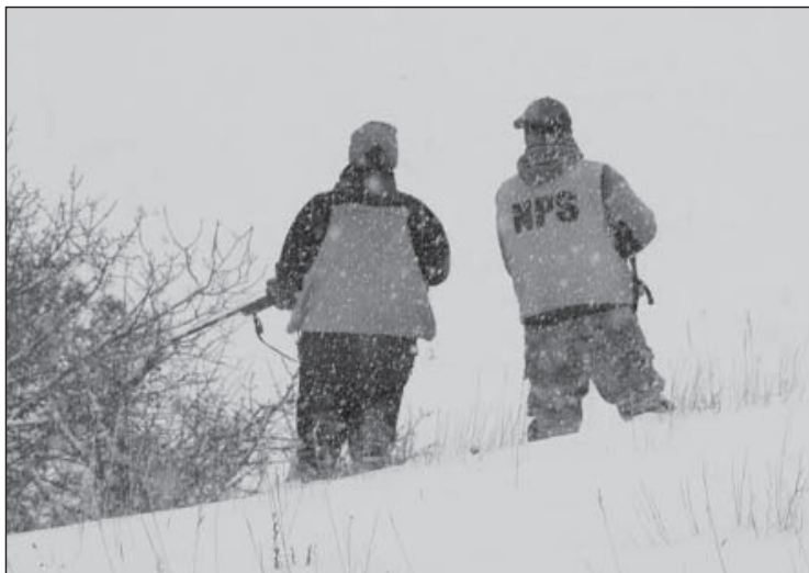
Figure 2. Staff member (right) and volunteer (left) engaged in elk reduction activities at Theodore Roosevelt National Park during 2010.

We used marked animals fitted with combination radio-telemetry and satellite tracking collars to locate groups of elk. When elk were located, team leaders attempted to maneuver marksmen to within 183 m of targeted animals, though longer shots were occasionally taken when distances could not be reduced and