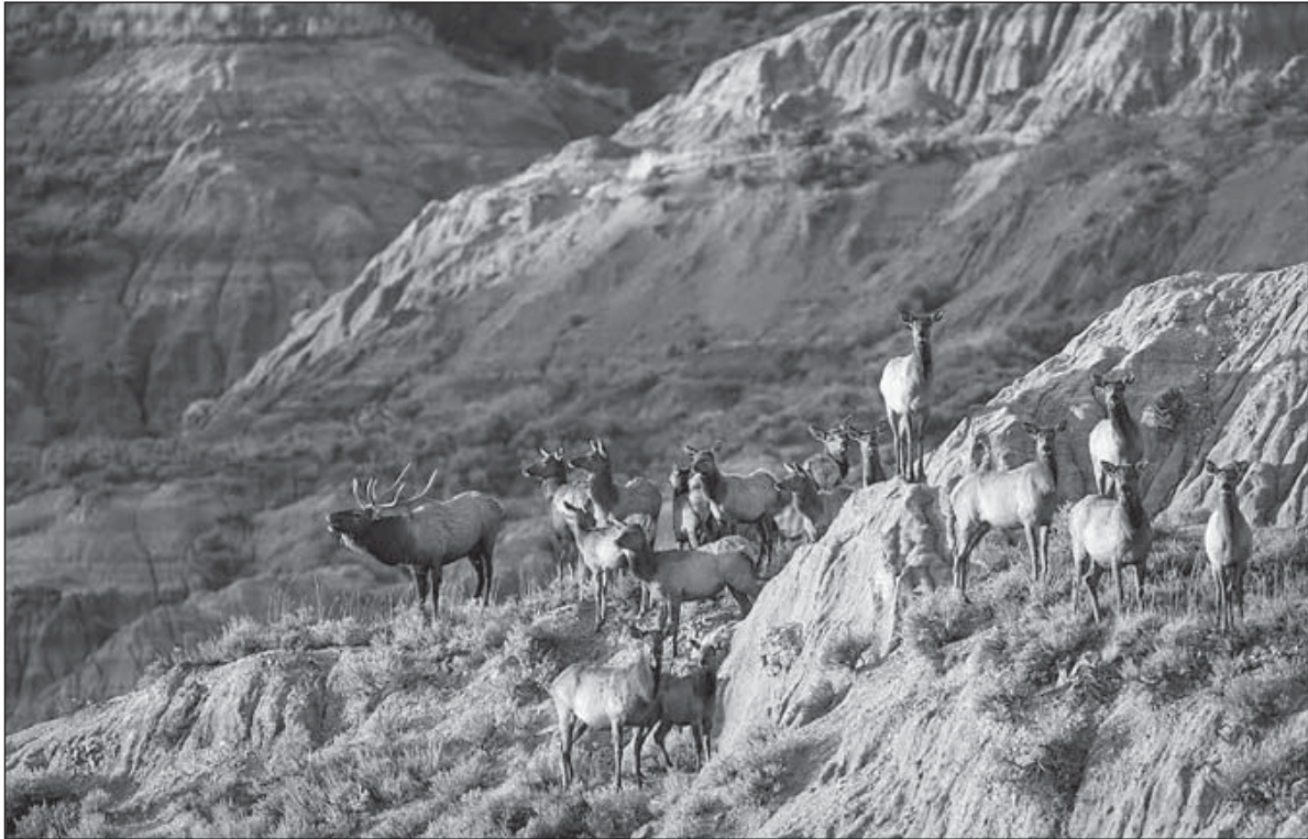
Figure 1. Elk in the badlands of North Dakota at Theodore Roosevelt National Park.

with directives related to federal firearms laws and use of non-lead ammunition in national parks. Meat (quarters, backstraps, and tenderloins) was recovered from culled animals, packed out of backcountry locations to a centrally located facility, then distributed to project volunteers, state food pantries across North Dakota, and various Native American organizations. Brain stem and lymphatic tissue were collected from all animals and screened for CWD. Remaining portions of carcasses were left to recycle into the environment.