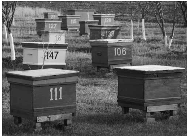
Figure 1. Bears are attracted to concentrated, high-energy food resources, such as found in apiaries.

We summarized conflicts by year, month, and region (Upper Peninsula [UP] or Northern Lower Peninsula [NLP]). Conflicts from 2011 were not used for analyses because the number of reports was incomplete. We used Pearson's correlation coefficients to estimate the relationship between the annual number of conflicts and number of bears by region derived