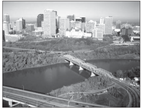
Aerial view of downtown Edmonton, Alberta, Canada, showing part of an extensive river valley park.

We studied DVCs in the metropolitan area of Edmonton, which is located in the aspen ( Populus tremuloides ) parkland ecoregion of Canada. Edmonton is Canada's sixth largest city, with >1 million residents, and is bisected diagonally by the North Saskatchewan River valley. Totalling 7,400 ha, the river valley and associated ravines create one of the largest expanses of urban parkland in North America (City of Edmonton 2007a). In addition to the river valley, Edmonton has >460 parks (City of