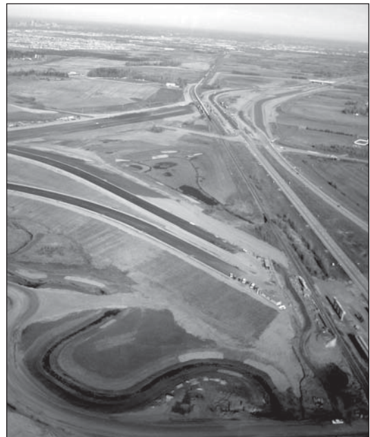
Highway interchange showing the combination of proximity to water, high-speed traffic, complex road configurations, and non-forested vegetation where DVCs are more likely to occur.

Landscape and traffic attributes of DVCs were analyzed using ArcGIS 8.3. We derived land-cover information from a combination of existing land-use data. Street network, land use, and traffic bylaw were provided by GeoEdmonton at the 1:20,000 scale, (City of Edmonton 2003). GeoGratis, a free web-based program of the Canadian federal government, provided Landsat 7 satellite imagery at 30-m resolution (Natural Resources Canada 2004), and Natural Resources Canada's National Topographic Database supplied forest