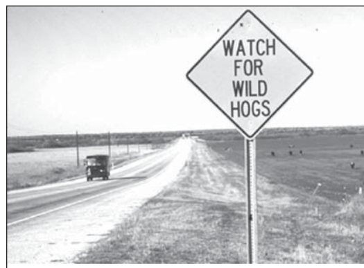
FIGURE 1. Feral hogs are common in many parts of the United States.

and cattle ranchers are concerned about the spread of swine brucellosis and pseudorabies (Hartin et al. 2007). Feral hogs are second only to coyotes ( Canis latrans ) as predators of sheep and goats in some areas of Texas (Mapston 2004). A 2004 survey of Texas landowners found that since feral hogs first appeared on private property, damage estimates averaged $7,515 per landowner statewide, with an estimated