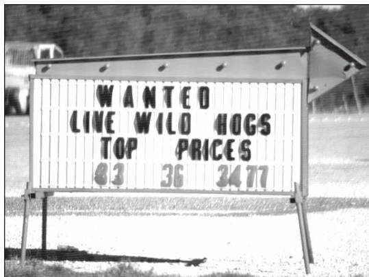
FIGURE 3. Commercial demand for “wild boar” meat in upscale restaurants in the northeastern United States and abroad has spawned a demand for feral hogs.

Hunters and landowners who cater to hog hunters view feral hogs as a challenging, tasty species of big game that may be hunted year-round in Texas. The mean value of a feral hog hunt to landowners in 1994 was $164 (Rollins 1994), and some landowners derive income by developing hunting enterprises around feral hogs (Chambers 1999). Hunting feral hogs is especially popular among bow hunters. The demand for so-called wild boar meat, especially in European markets, has increased the price for live feral hogs; and prices offered usually exceed those for domestic pork (Weems 1999; Figure 3). Accordingly, trapping feral hogs in various cage-traps has become increasingly popular in recent