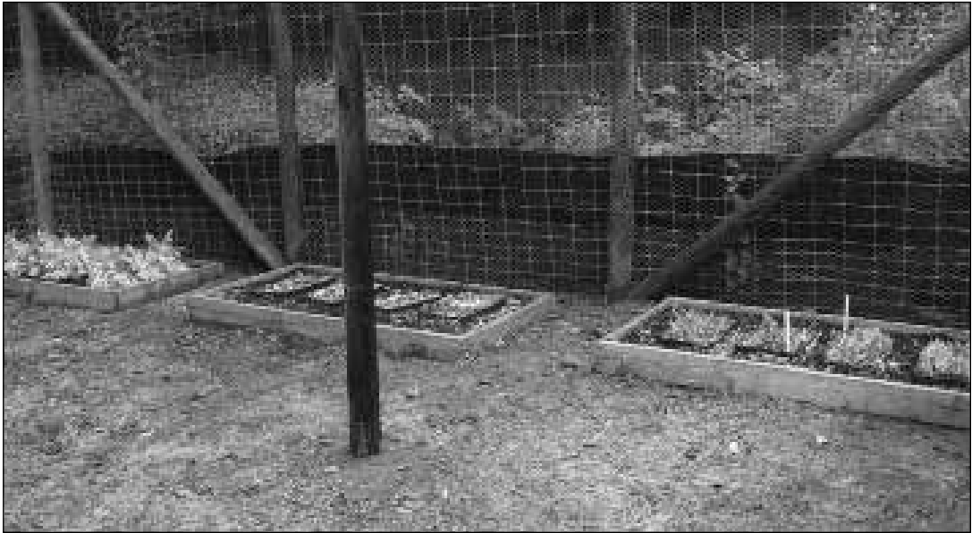
Figure 2. Photograph taken at the conclusion of 1 of the lettuce trials. The center raised bed was an untreated control, while the other two were treated. Note silt fence, vegetation management within the enclosure, and web trays planted in the raised beds. Photographer is standing in the central vegetated rabbit cover area.

We selected plant material based upon findings from literature searches and informal interviews of nursery professionals; all material was known to be highly susceptible to rabbit damage. We chose Viola tricolor L. (“Helen Mount” Johnny Jump-Up), Lactuca sativa L. (“Allstar” Gourmet Lettuce Mix), and Medicago sativa L. (“Summer” Alfalfa) from Johnny’s Select Seeds (Winslow, Me.). Most repellents we tested were not labeled for use on produce, except for Bonide Deer & Rabbit Repellent. Despite its being grown for human consumption, we chose Lactuca sativa because it was a plant reported to be highly susceptible to rabbit herbivory.