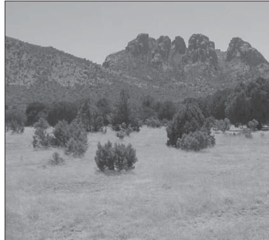
Western Texas landscape.

gates. Traps were constructed from 1.6-cm angle iron and 10.2-cm grid cattle panels. Trapping and handling procedures were approved by Sul Ross State University Animal Use and Care Committee and Texas Parks and Wildlife Department permit SPR-0592-525. Each trap was placed in an area of localized hog signs and pre-baited for several days with soured corn and carrion. Traps were checked every 24 hours. Captured feral hogs were sedated with a combination of telazol and xylazine at 4.4 mg/kg of estimated body weight delivered by a jab stick (Gabor et al. 1997). Sedated feral hogs were aged according to Matschke (1967), ear-tagged, and fitted with a mortality-sensitive radio collar (Advanced Telemetry Systems, Inc., Isanti, Minn.). Juveniles were defined as feral hogs that were born within the past year (young of the year). Efforts were made to radio-collar only 1 hog/sounder.