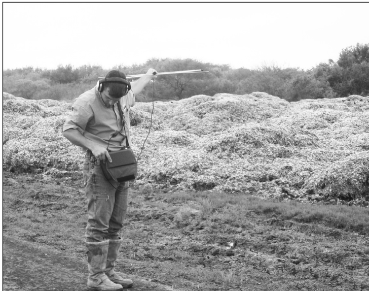
Figure 1. Study personnel using ground-based radio-telemetry to locate feral swine at a whole-cottonseed storage site in Kleberg County, Texas, during February 2008.

We collected samples of cottonseed from various areas at the storage sites where feral