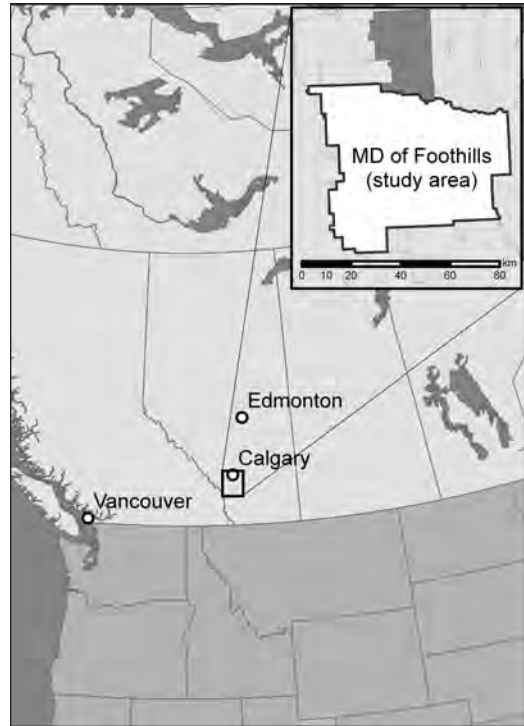
Figure 1. Study area map and boundaries, Municipal District (MD) of Foothills and Bragg Creek.

The study area was within the Municipal District 31 of Foothills (50° 19' to 50° 55' N; 113° 30' to 114° 31' E) in southern Alberta, Canada (Figure 1), encompassing an area of 1,448 km 2 . The region contained numerous small to mid-sized communities, with 100 to 700 households per community and a rural population of approximately 7,065 people (Statistics Canada 2006, MADGIC 2007). The region was characterized by topography ranging from rolling grasslands to wooded foothills extending westward toward the Rocky Mountains. The northern boundary of the study area was adjacent to the city of Calgary, with a population of approximately 1 million, and the Foothills Municipal District of was one of the fastest-growing districts in Alberta (AlbertaFirst 2007). Agriculture was the predominant land use in the Foothills, with cattle ranching and cultivation constituting a large portion of the agricultural activities. Petroleum development and some forestry constitute the industrial uses of the land. However, it was the rapidly-increasing demand for rural residential subdivision that was the primary driver of significant regional landscape change. This trend was consistent with the rural migration that characterizes much of the Rocky Mountain West (Duke et al. 2003, Papouchis 2004, Southern Foothills Study 2007, White 2007) and made the study area representative and relevant to many other parts of North America.