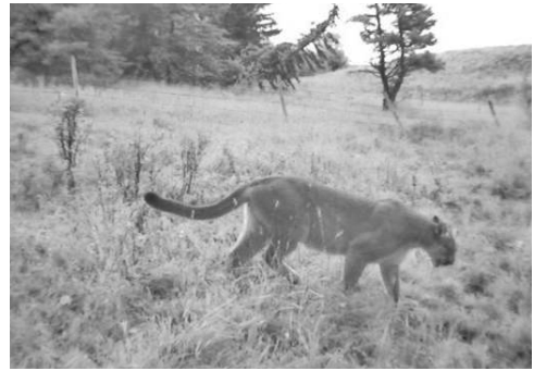
Figure 4. A cougar image captured by a remote camera deployed in the study area.

and if residents lack proper understanding and awareness of cougars, tolerance toward the species may quickly diminish (Figure 4).