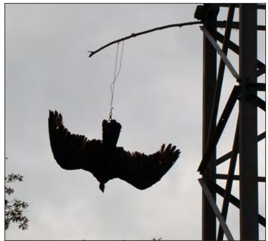
Figure 1. Vulture effigy hangs from tower near U.S. Marine Corps Air Station, Cherry Point, North Carolina.

The MCAS Cherry Point airfield is located alongside a major river system and bordered on 2 sides by large creeks. The North Carolina coastal plain, where the air station is located, is level, sandy ground consisting of mixed pine and hardwood trees with a relatively flat forest canopy topping out at about 21 m in height. Turkey vultures seek out man-made towers here, including water towers, cellular phone towers, and other communication and electrical towers. The towers can be anywhere from 20 m to >91 m in height, penetrating the canopy and providing the birds with a panoramic view of the landscape. The water towers provided an added advantage for vultures in winter because the structures blocked the wind and also reflected the sun in the morning. Birds standing