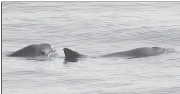
Figure 1. Vaquita ( Phocoena sinus ) swimming in the Upper Gulf of California.

for the Recovery of the Vaquita) in 2015 estimated that the entire world populations may consist of <30 individuals (Jaramillo-Legorreta et al. 2017).