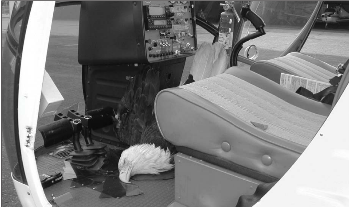
Figure 2. Damage to helicopter windscreens occur when wildlife, such as this bald eagle ( Haliaeetus leucocephalus ), collide with aircraft during flight.

(Zar 1996) to compare the number of wildlife strikes among various impact locations on the aircraft for civil helicopters and rotary-wing aircraft from each of the 4 military services (separately).